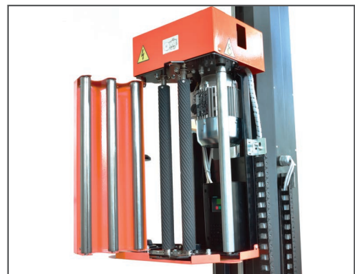
IN OPTION: POWER PRE-STRETCH CARRIAGE

Power Pre-Stretch carriage; 1650 mm turntable; Pit frame; Ramp.