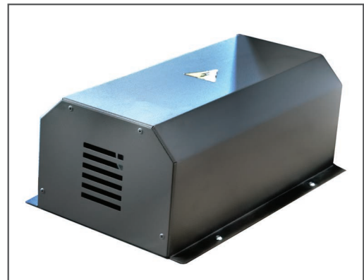
CARTER FOR ROTATION'S MOTOR